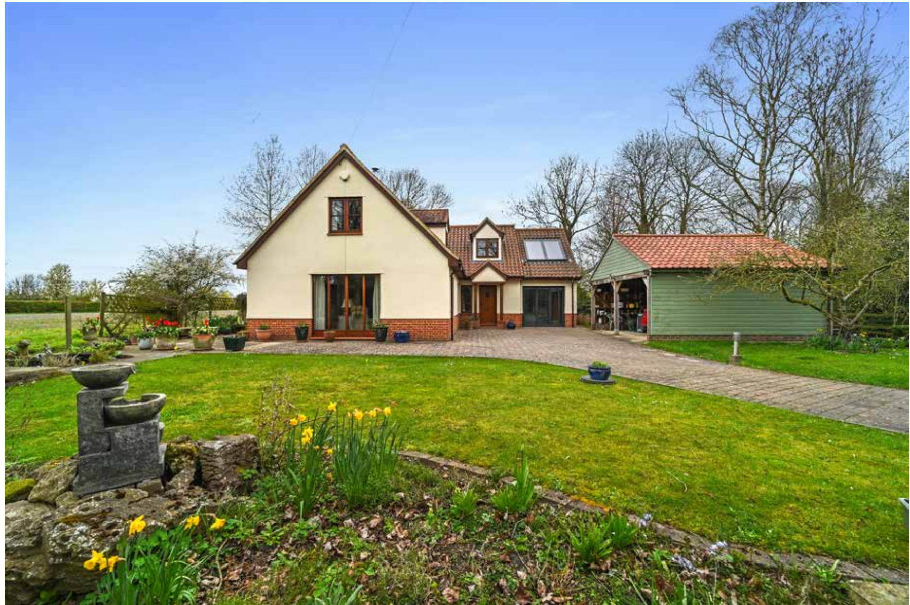
Stacks Mellis Road | Yaxley, Eye | Suffolk | IP23 8DB