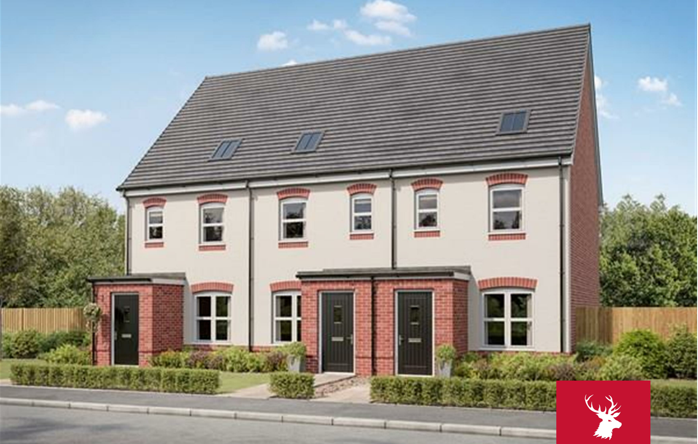
The Braunton, plot 101