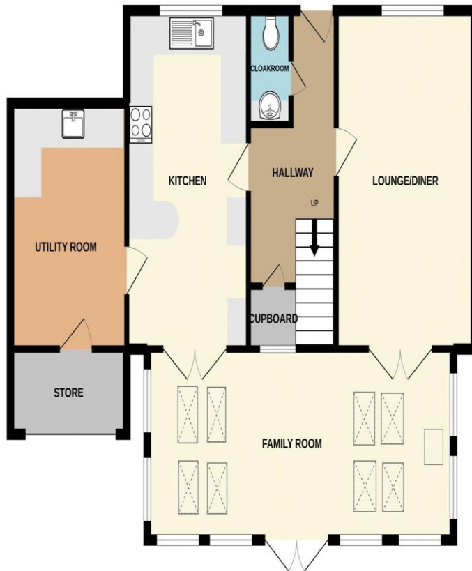
GROUND FLOOR 878 sq.ft. (81.6 sq.m.) approx.