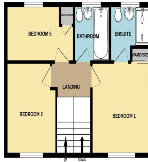
1ST FLOOR 452 sq.ft. (42.0 sq.m.) approx.