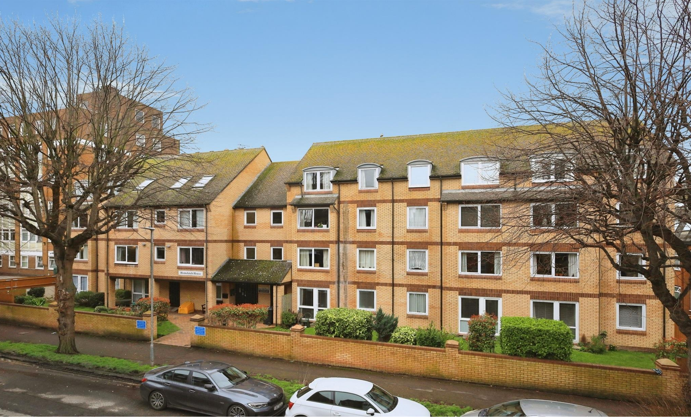
Homelatch House St. Leonards Road, Eastbourne BN21 3UW