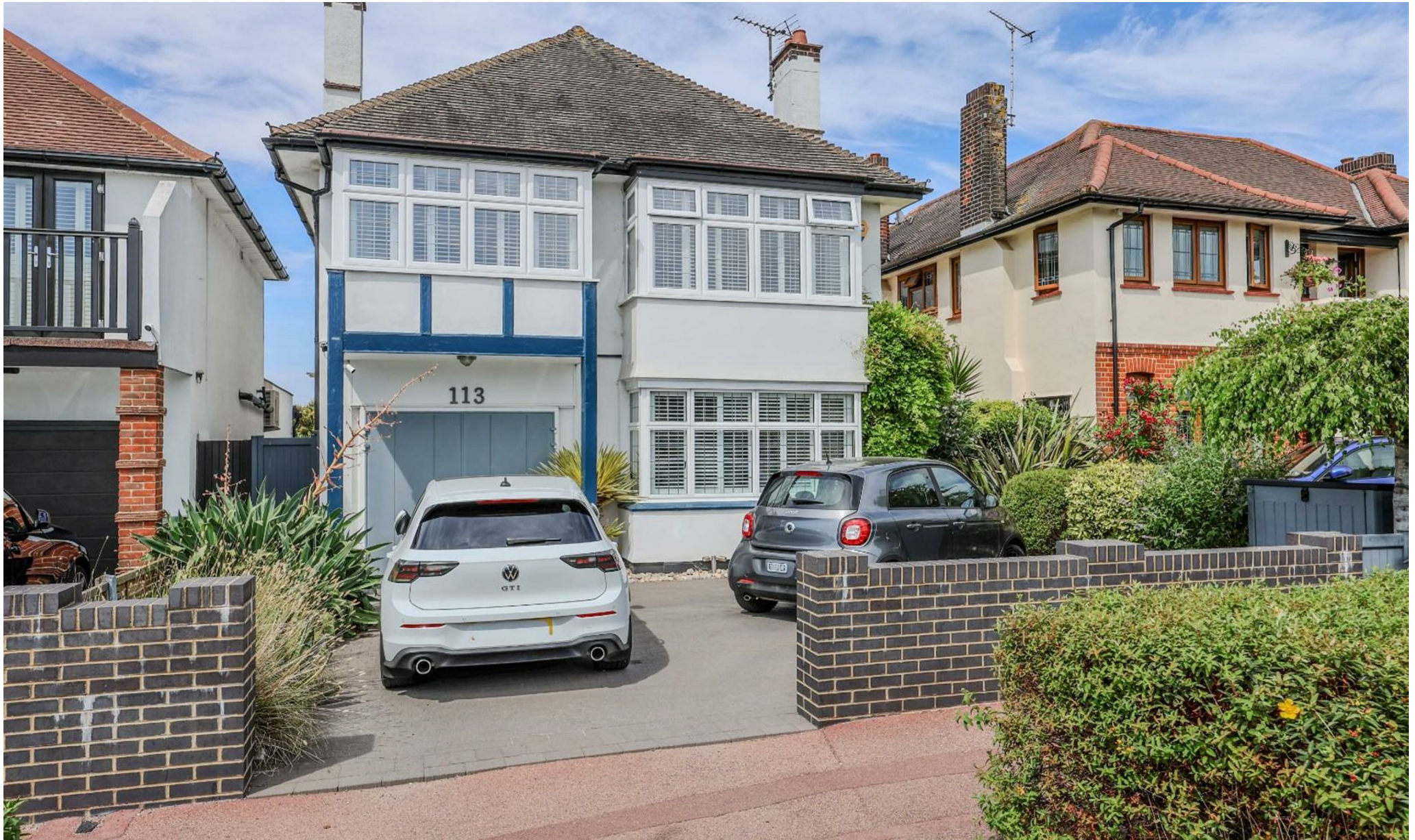
Marine Parade, Leigh-On-Sea £1,295,000