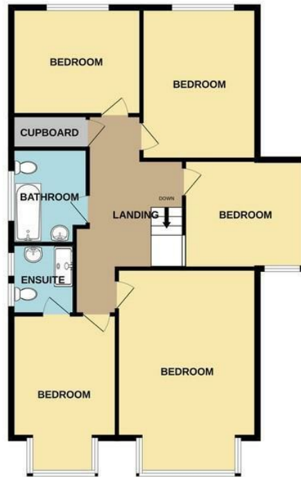
1ST FLOOR 1015 sq.ft. approx.