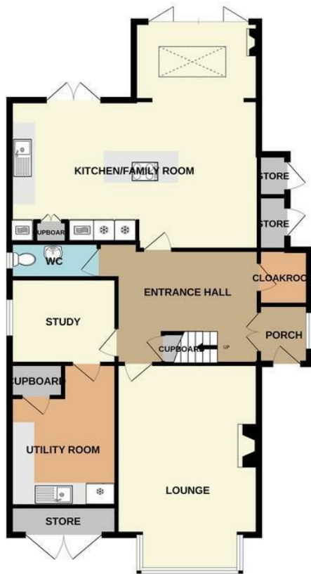
GROUND FLOOR 1094 sq.ft. approx.