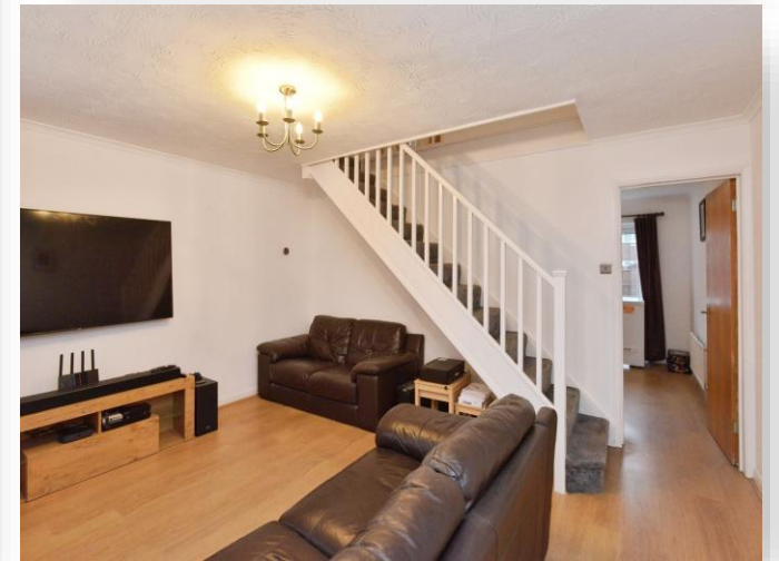
Elthorne Way, Newport Pagnell, MK16 0EH