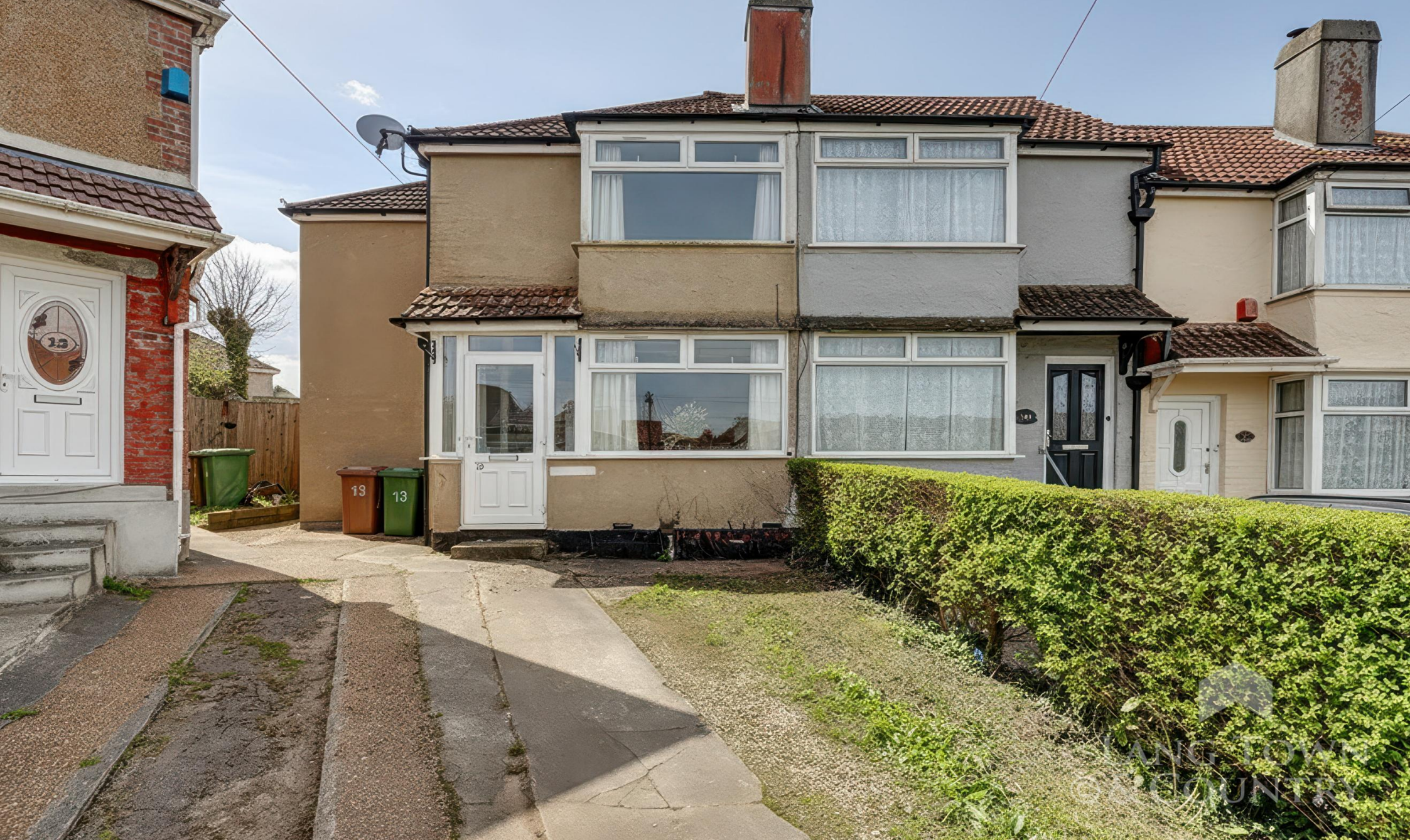
13 Coronation Place, St Budeaux, Plymouth, Devon, PL5 1UP