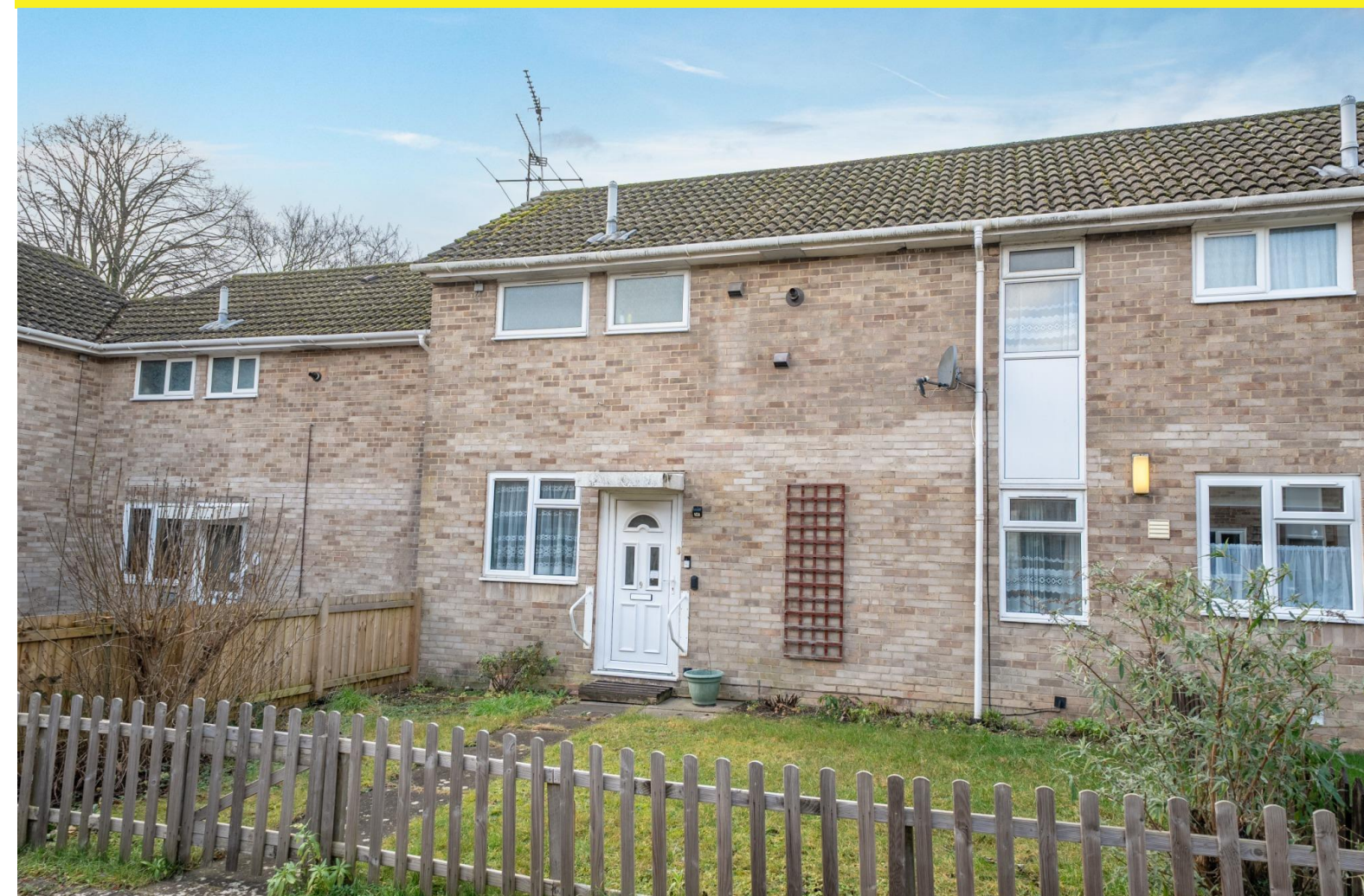
Larwood Square, Andover