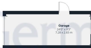
Ground Floor Building 2