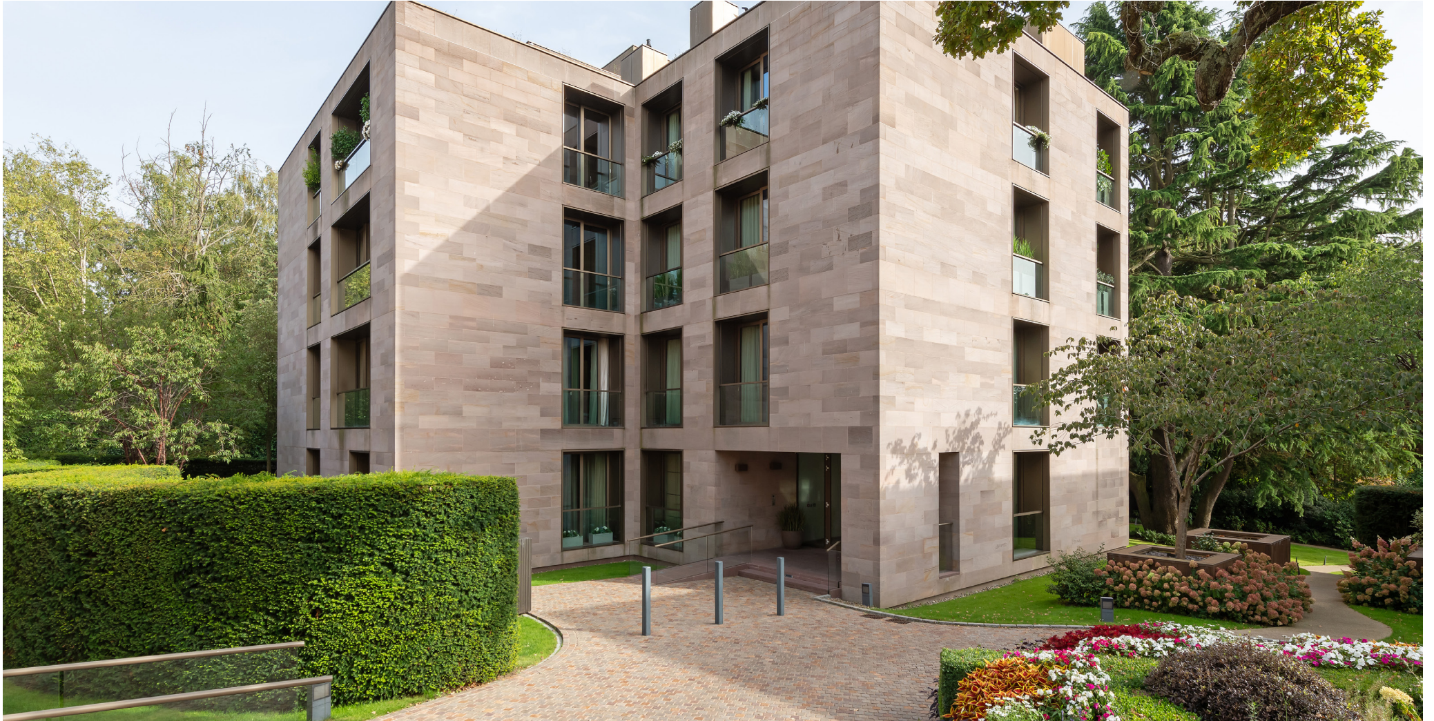
CAENWOOD COURT, London N6