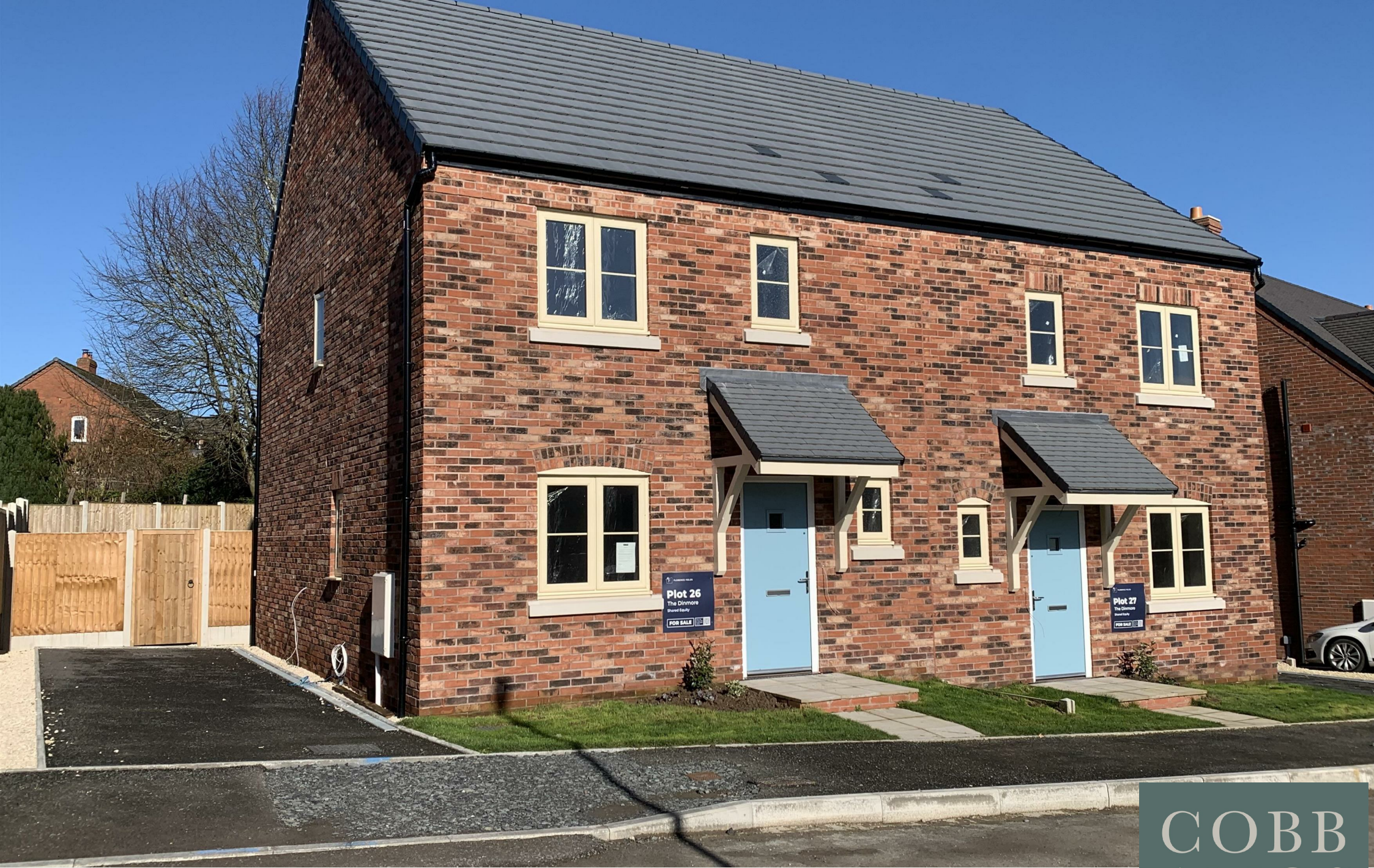
The Dinmore, Plot 26, Florence Fields, Leintwardine, SY7 0DF Price £264,995