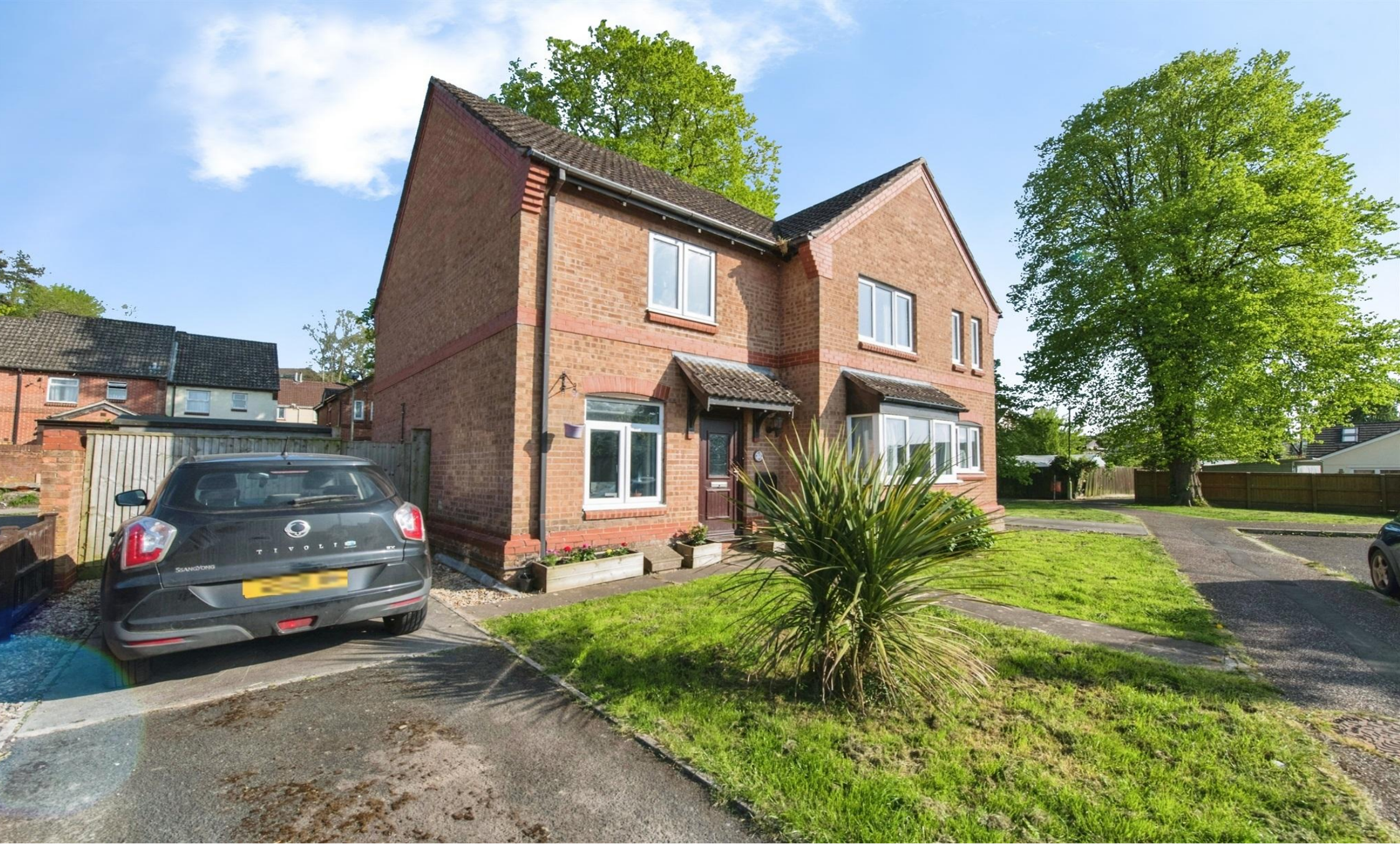
The Cricketers, Axminster EX13 5RG