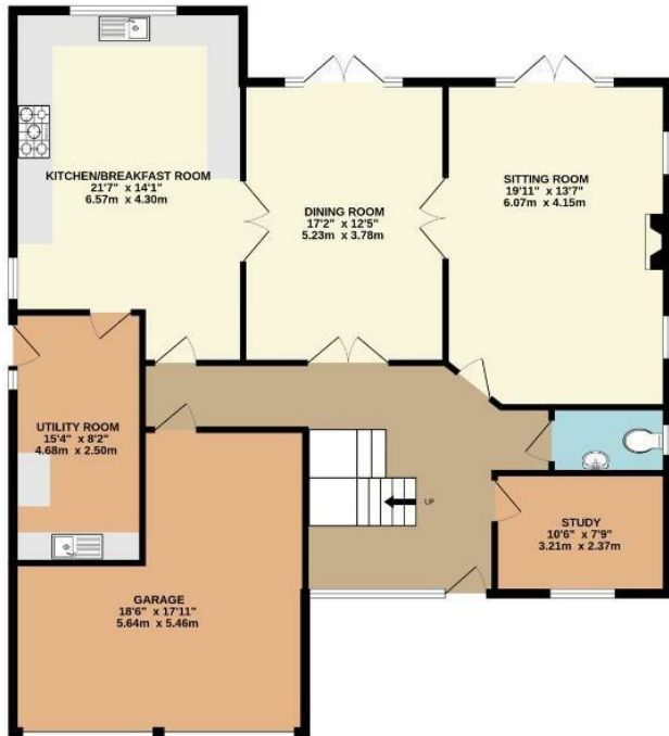
GROUND FLOOR 1349 sq.ft. (125.3 sq.m.) approx.