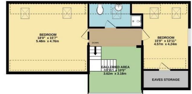
2ND FLOOR 624 sq.ft. (58.0 sq.m.) approx.