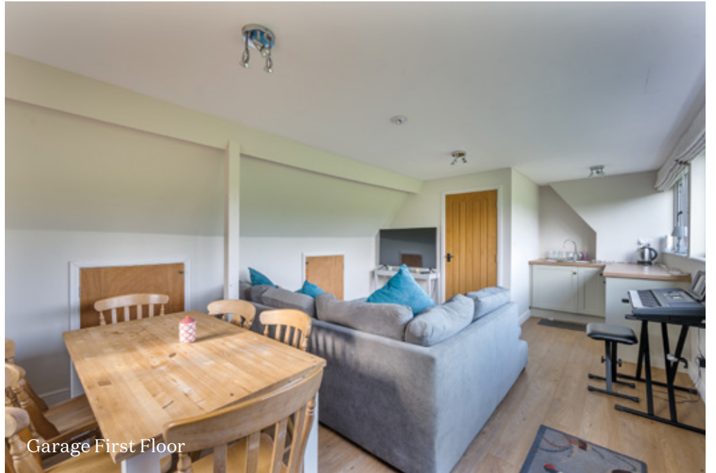
Garage First Floor