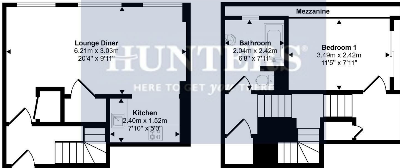
Ground Floor Approx 32 sq m / 341 sq ft

Approx Gross Internal Area 60 sq m / 645 sq ft