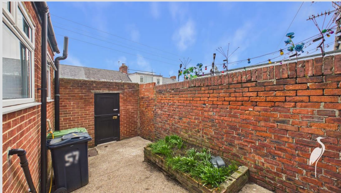
Low maintenance courtyard to the rear.