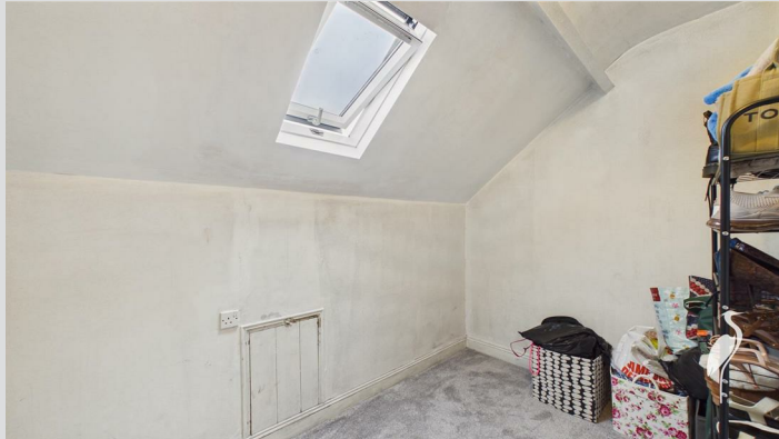
Double glazed skylight window.