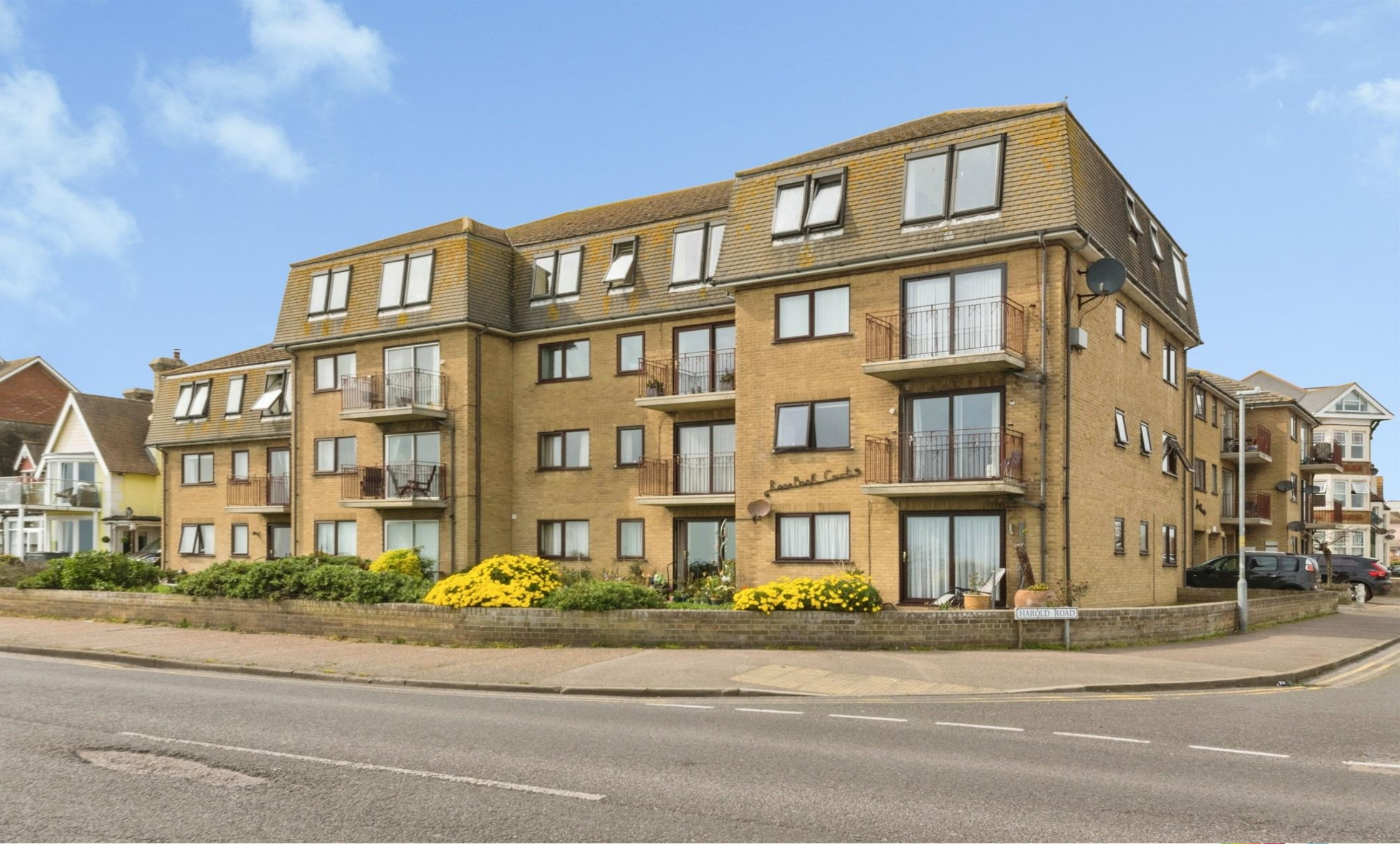
Rose Bank Court Marine Parade East, Clacton-On-Sea CO15 6AD