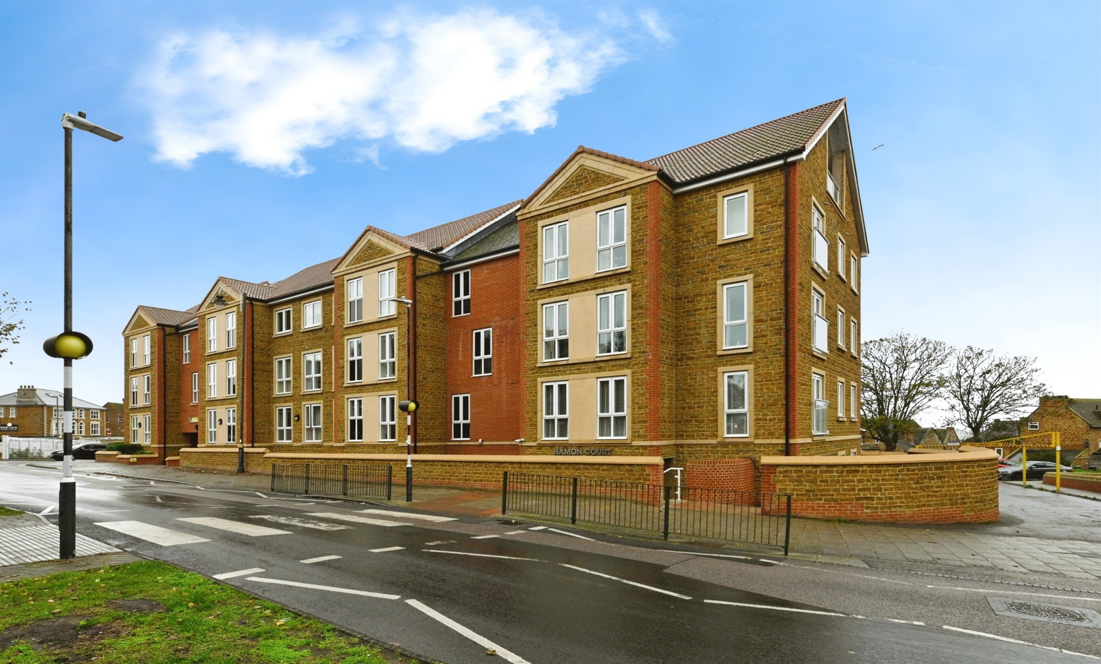
Hamon Court, St. Edmunds Terrace, Hunstanton, PE36 5EH