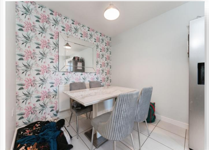
Mace Road, Mildenhall IP28 7FP