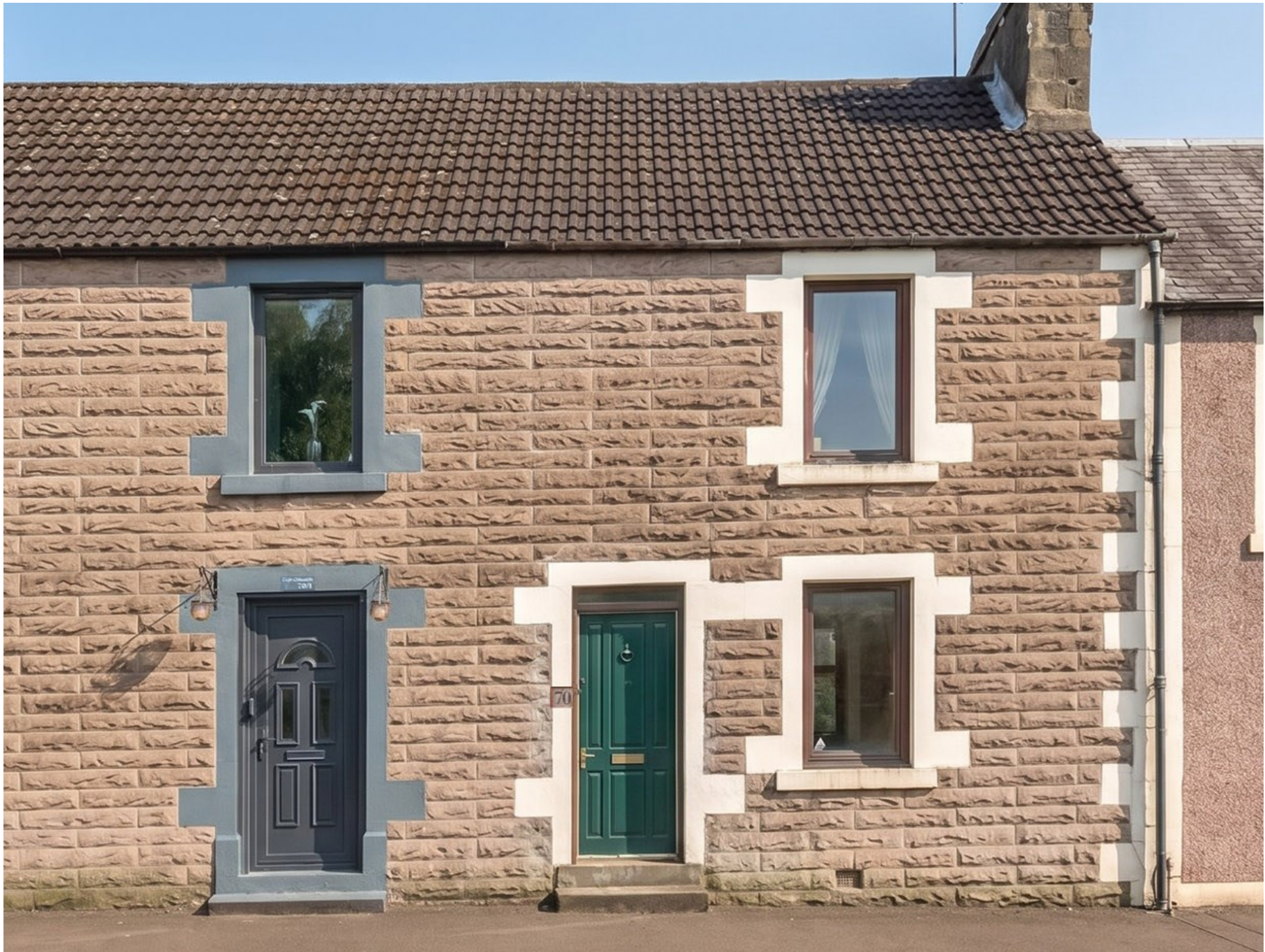
70/2 BURRELL STREET, CRIEFF, PH7 4DG