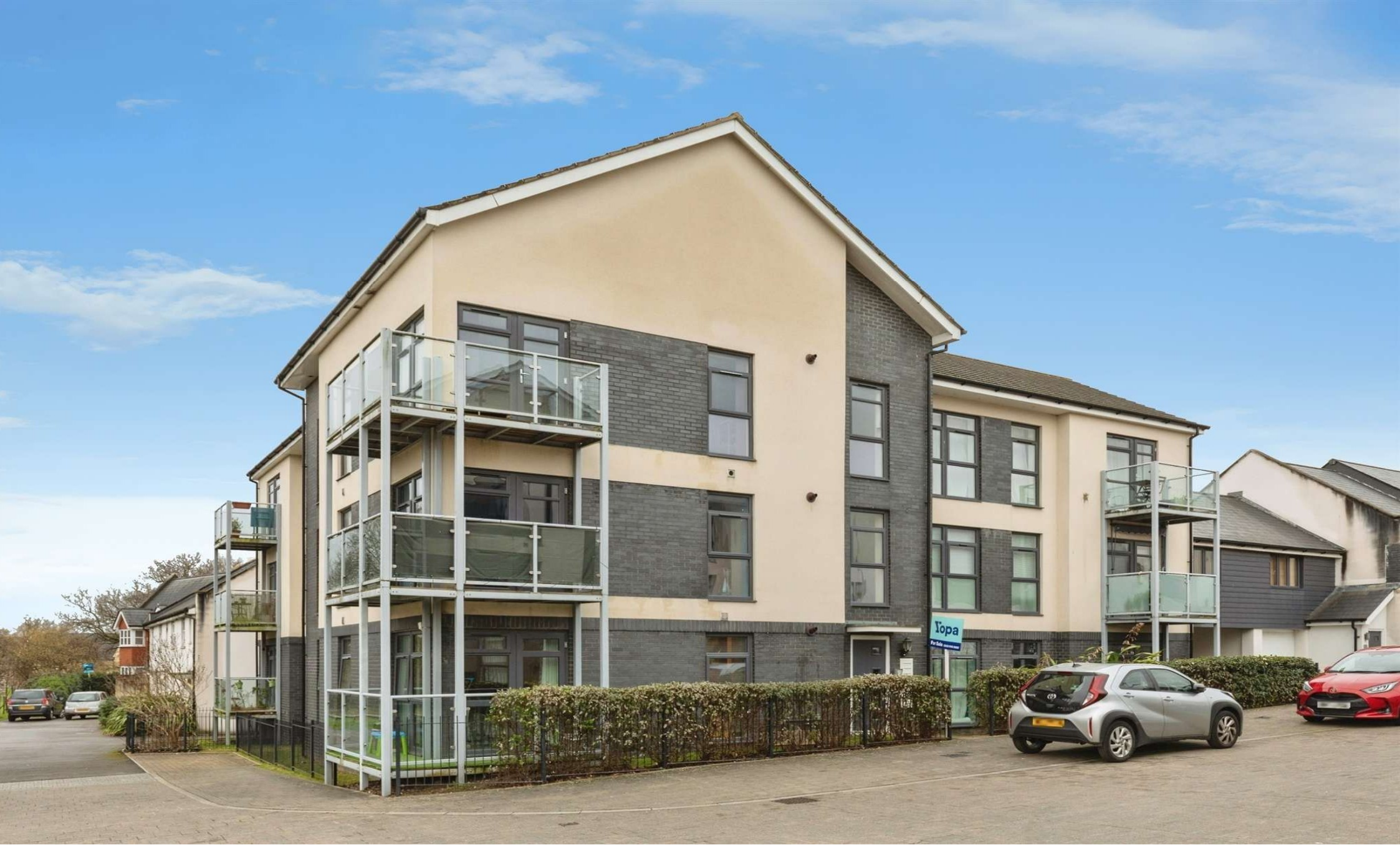
Wood Street, Patchway Bristol BS34 5AH