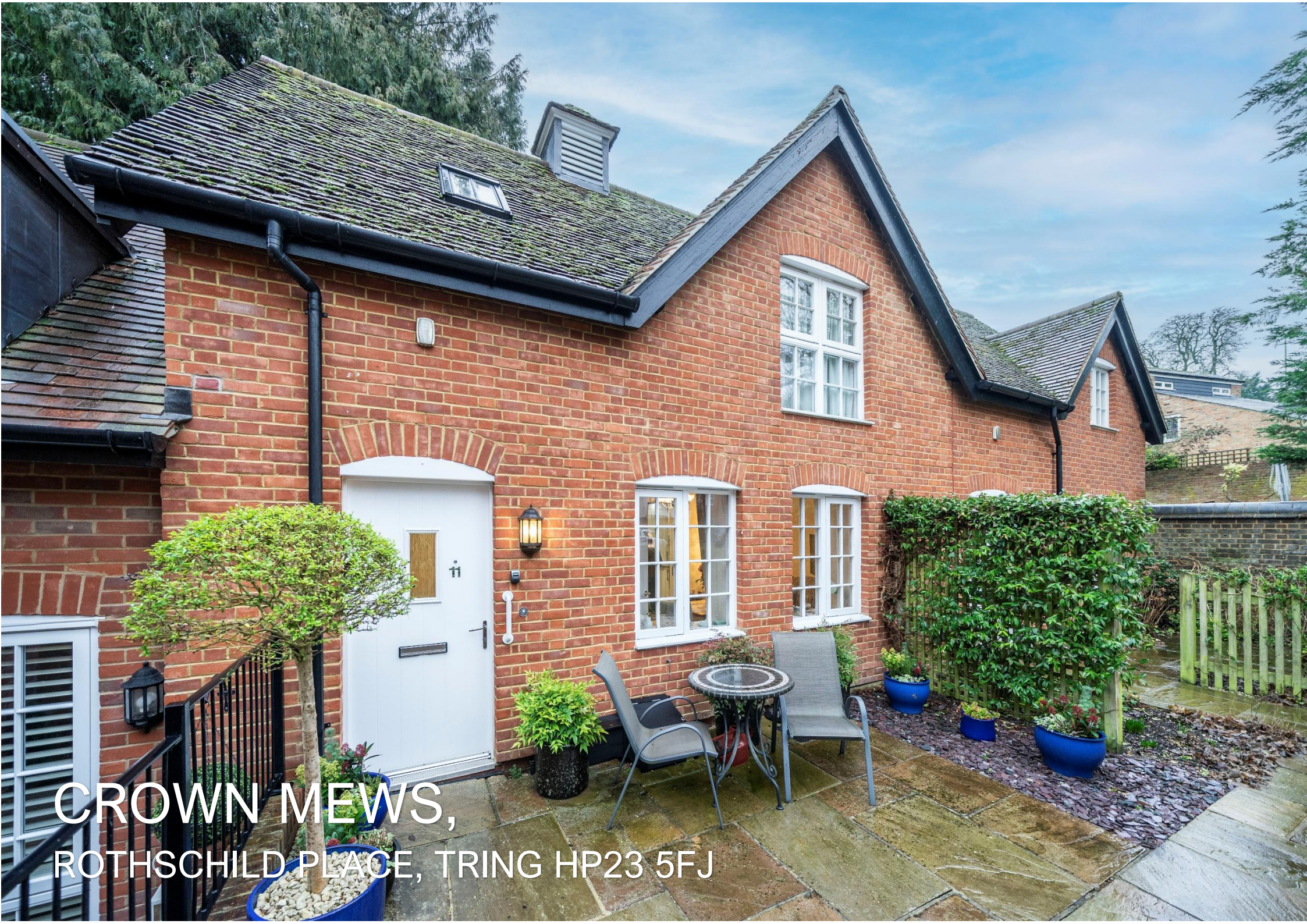
CROWN MEWS, ROTHSCHILD PLACE, TRING HP23 5FJ