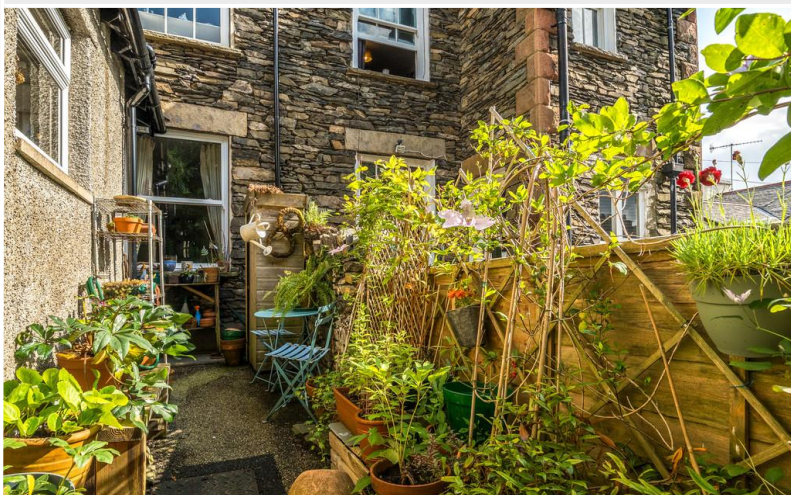
Rear Entrance and garden