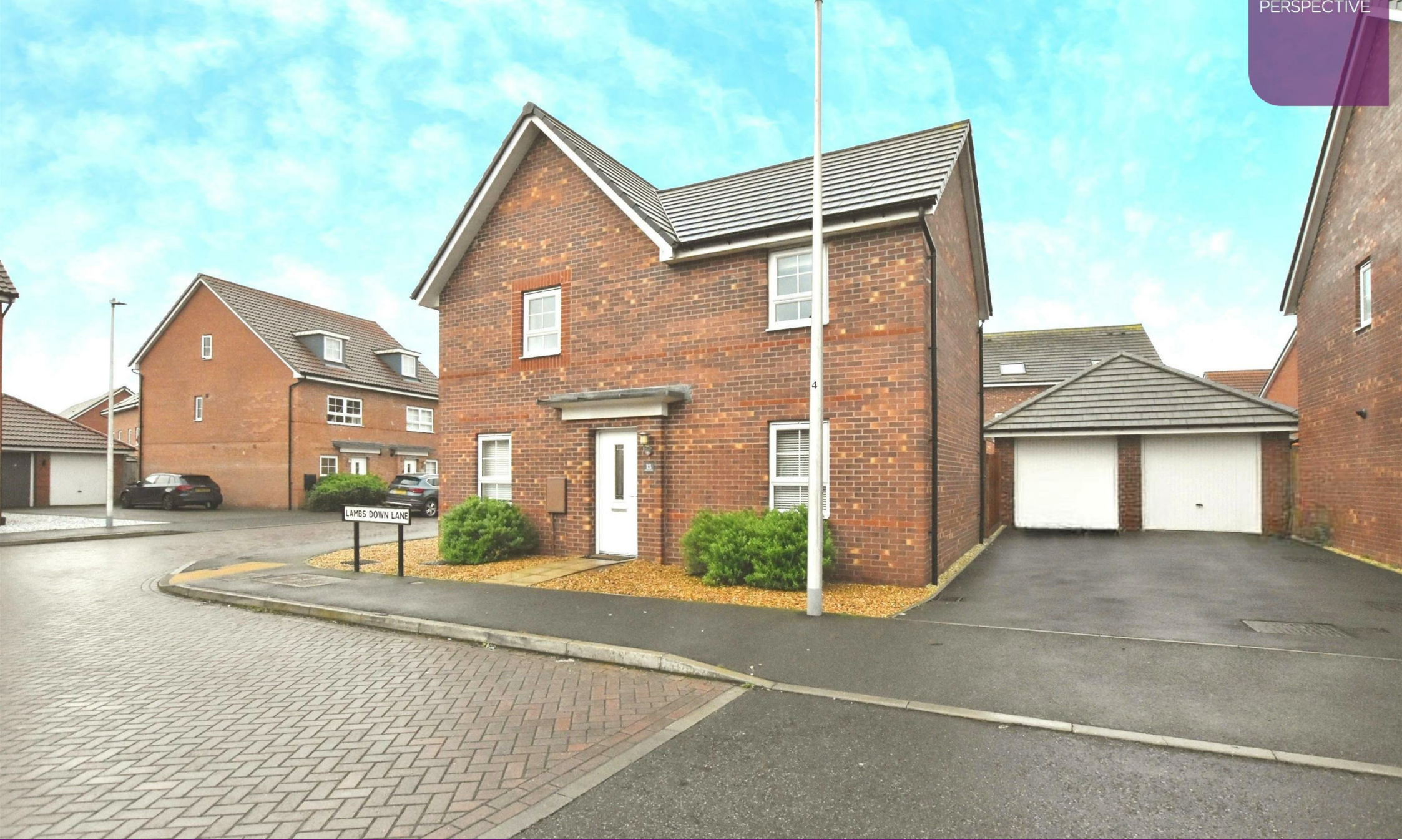
13 Lambs Down Lane, Nuneaton, CV11 6BU £400,000