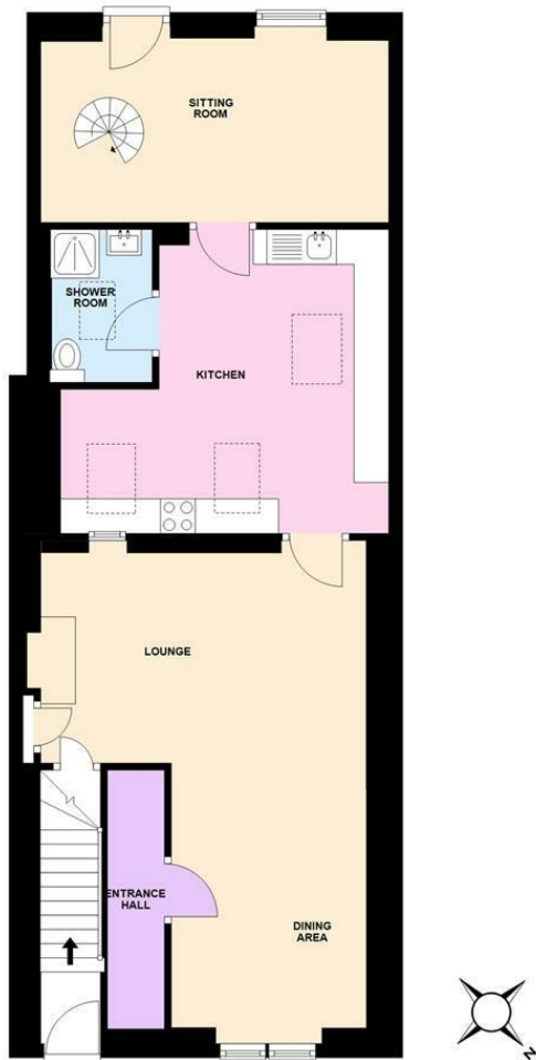
BAYVIEW, 2 ALMA TERRACE GROUND FLOOR