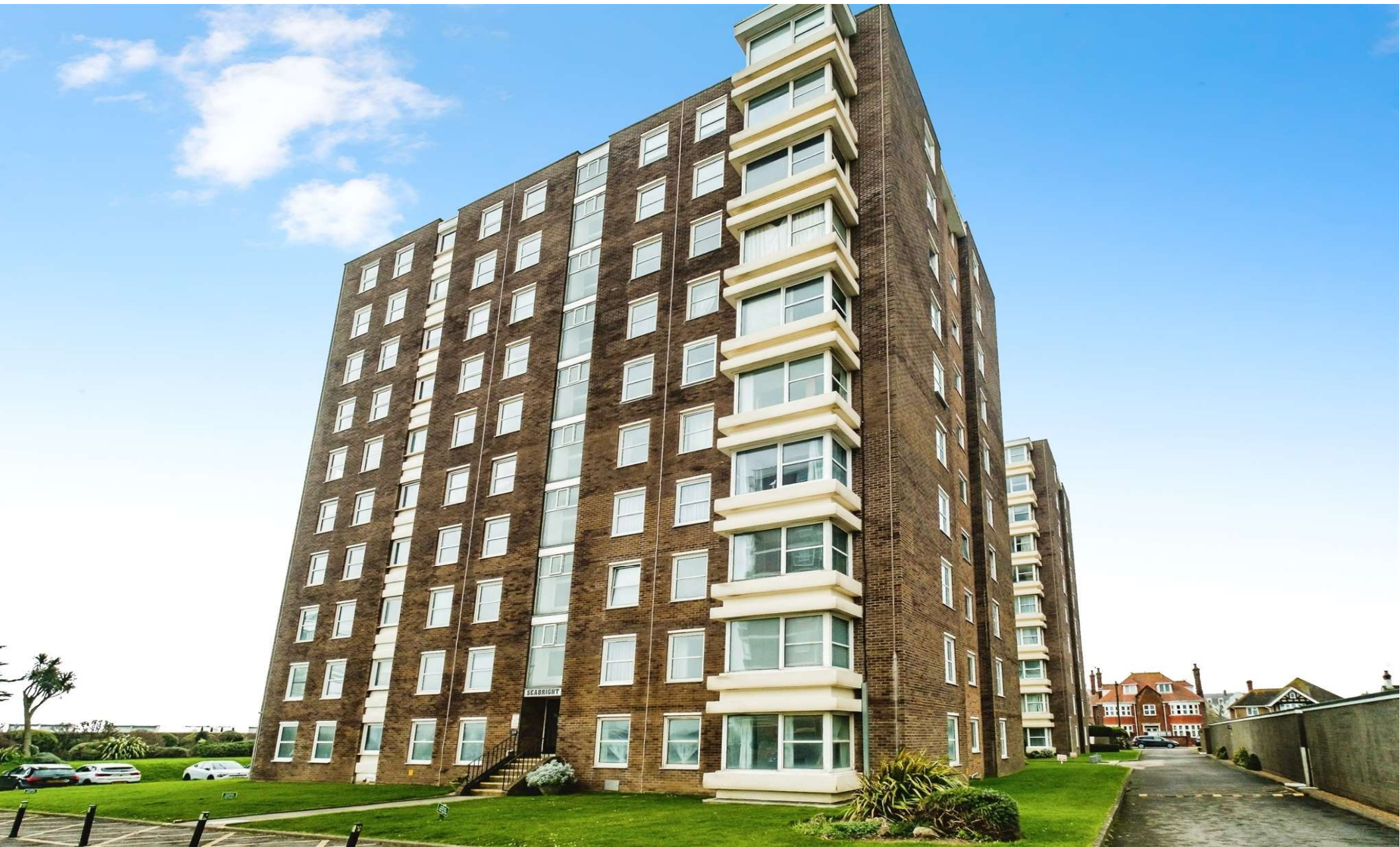
Seabright West Parade, Worthing BN11 3QU