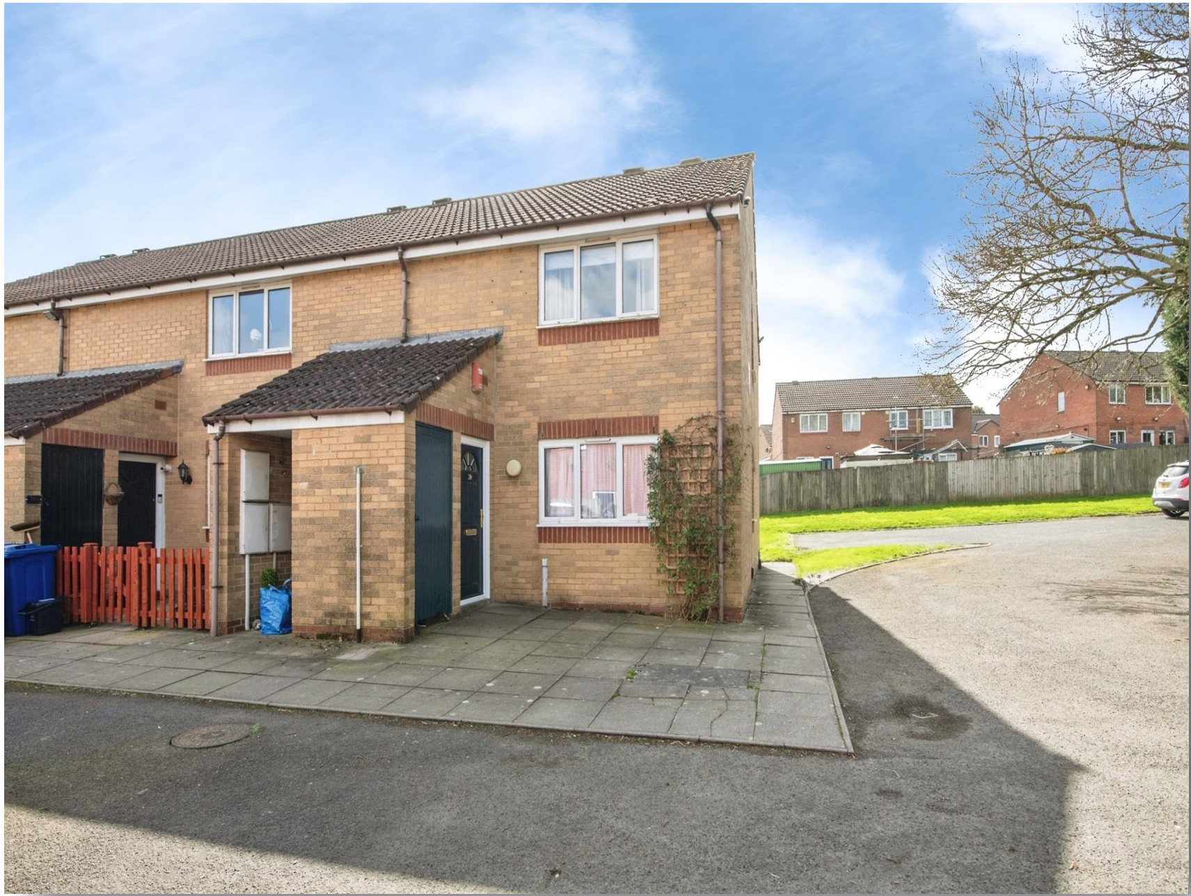
Arcal Street, Dudley DY3 1TG