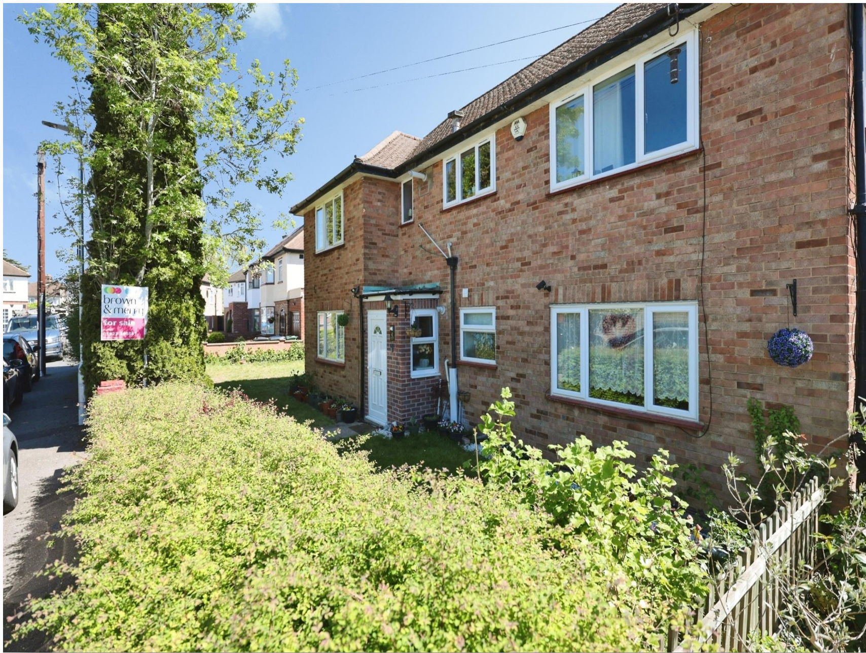
Lansdowne Close, Watford, WD25 9RE