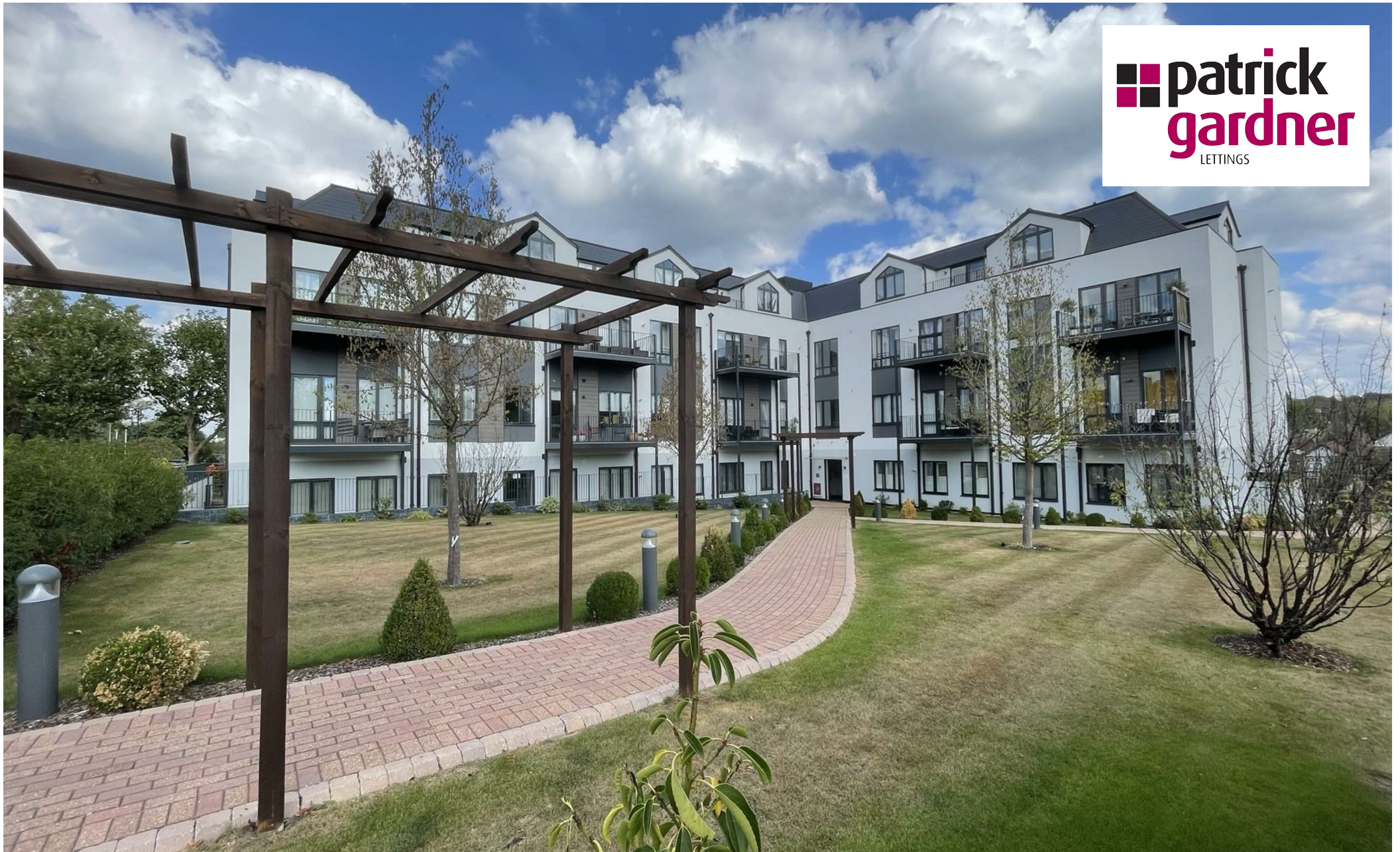
Opus Court, Bay Tree Avenue, Leatherhead, KT22 7UG