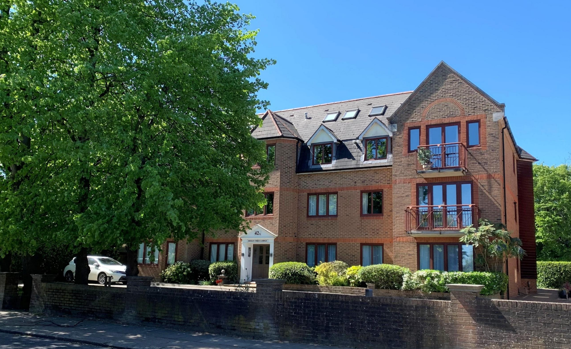
Holly Tree Lodge, The Ridgeway, Enfield, EN2 8QT