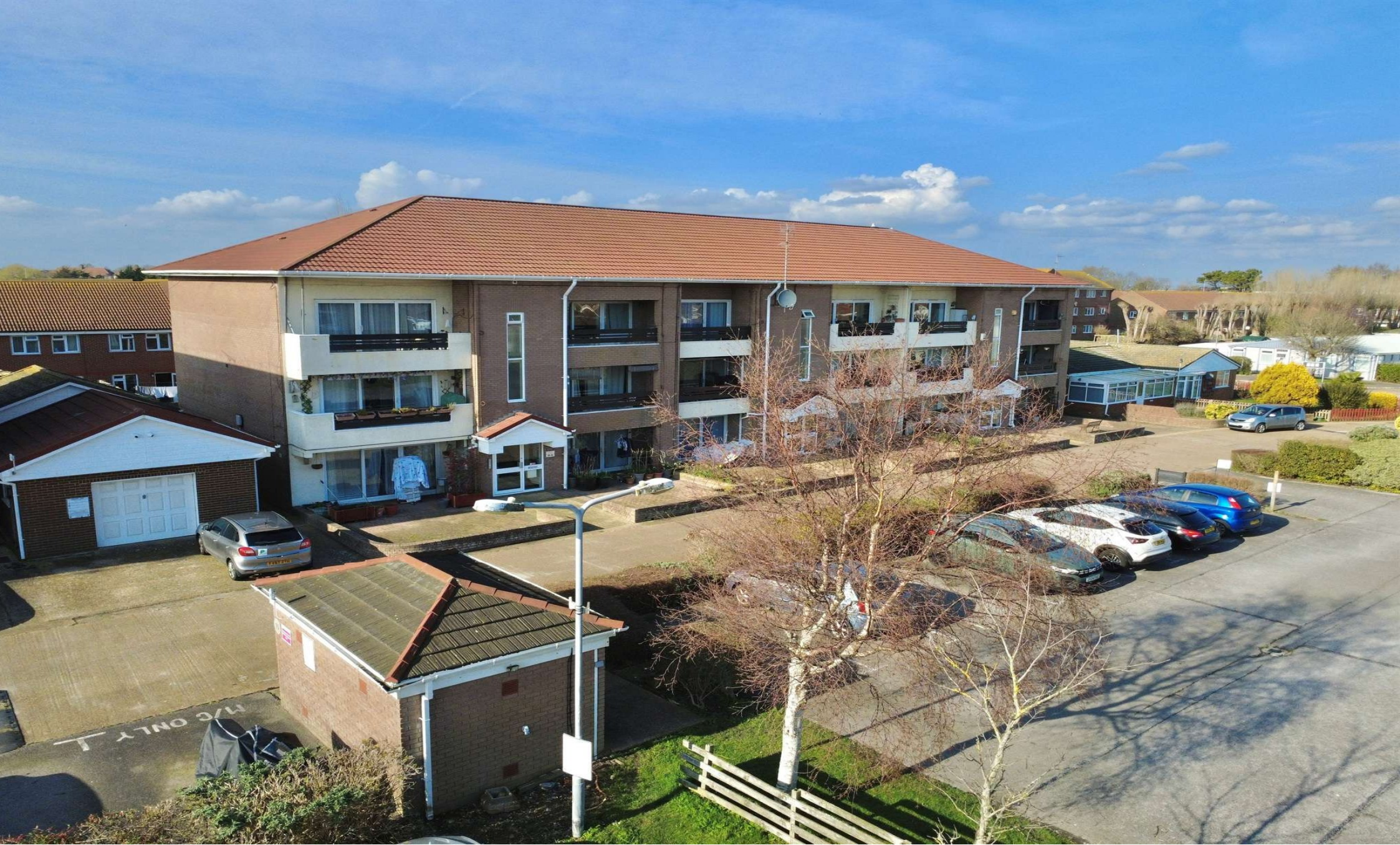
Kings Court East Viking Way, Eastbourne BN23 6UG