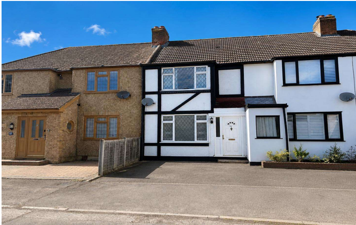
Warwick Avenue, Egham, TW20 8LR