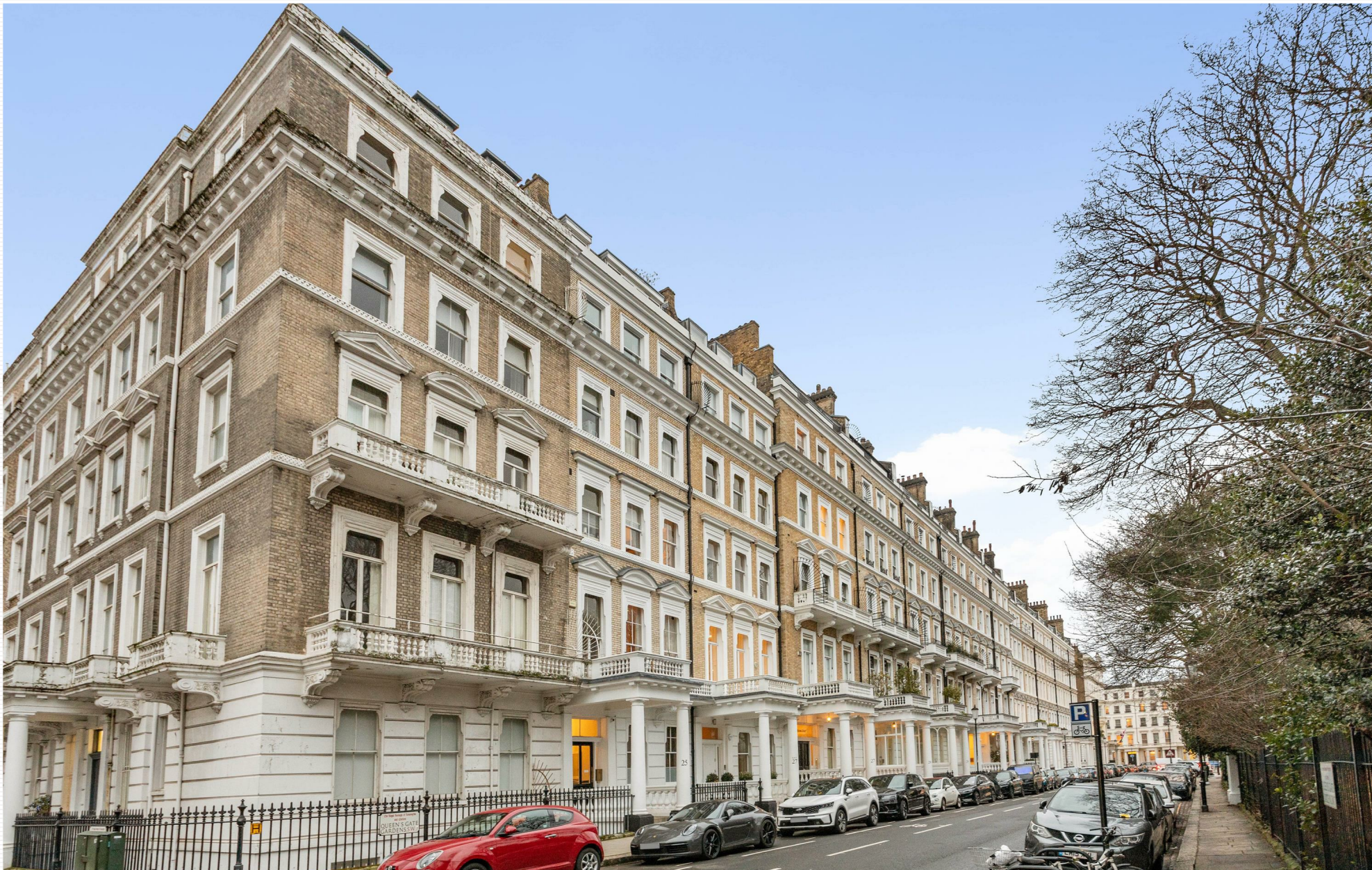
Queen's Gate Gardens, South Kensington, SW7 5RP

Guide Price £1,000,000 Share of Freehold