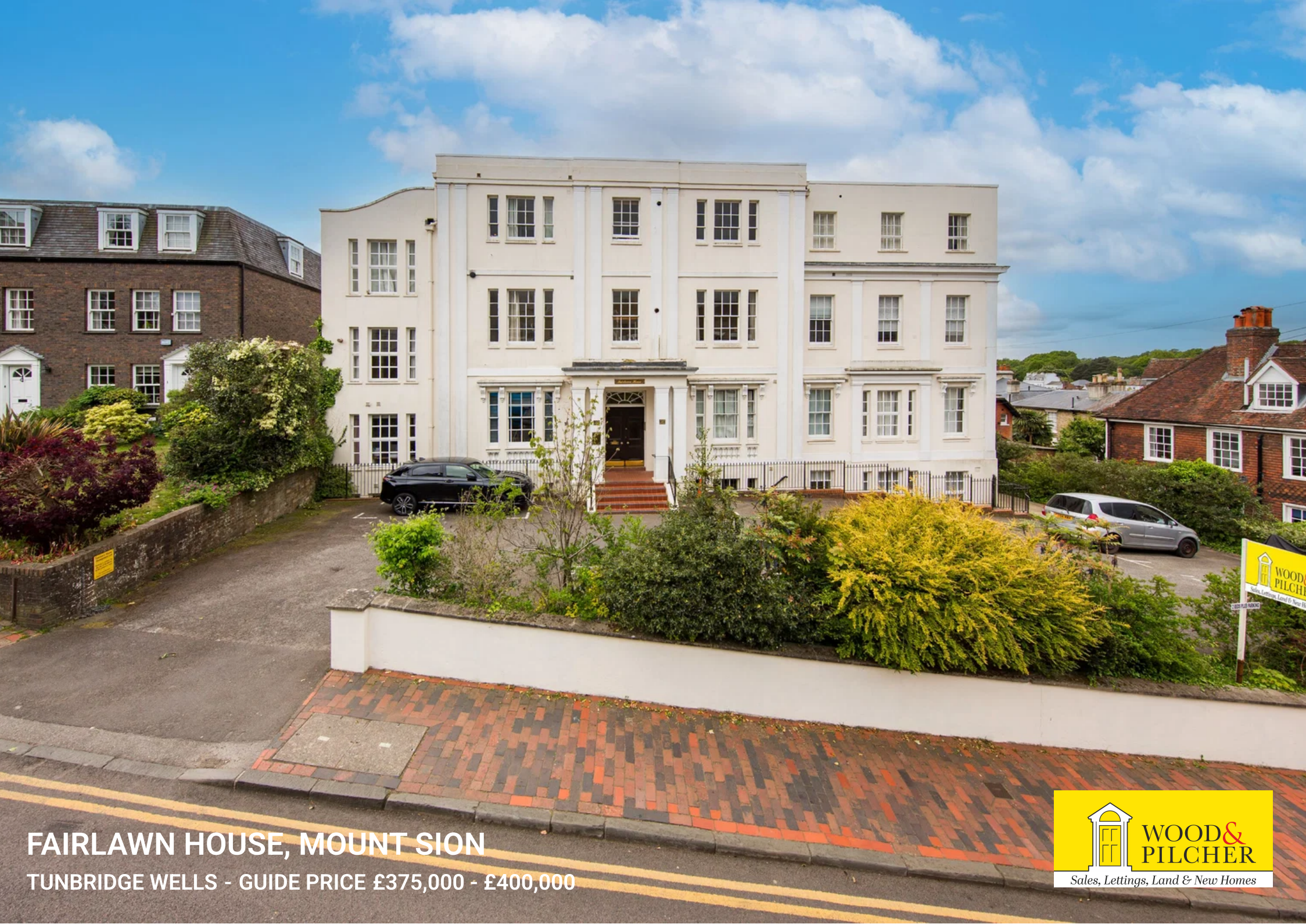
FAIRLAWN HOUSE, MOUNT SION TUNBRIDGE WELLS - GUIDE PRICE £375,000 - £400,000