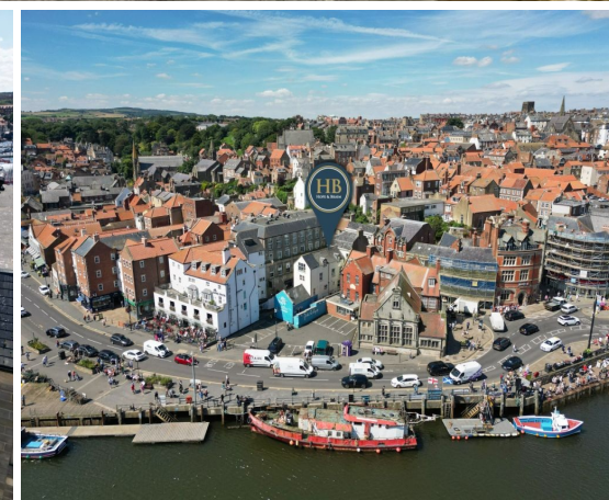
APARTMENT 5, HARBOUR VIEW, WHITBY- 5 bed Apartment -£399,950