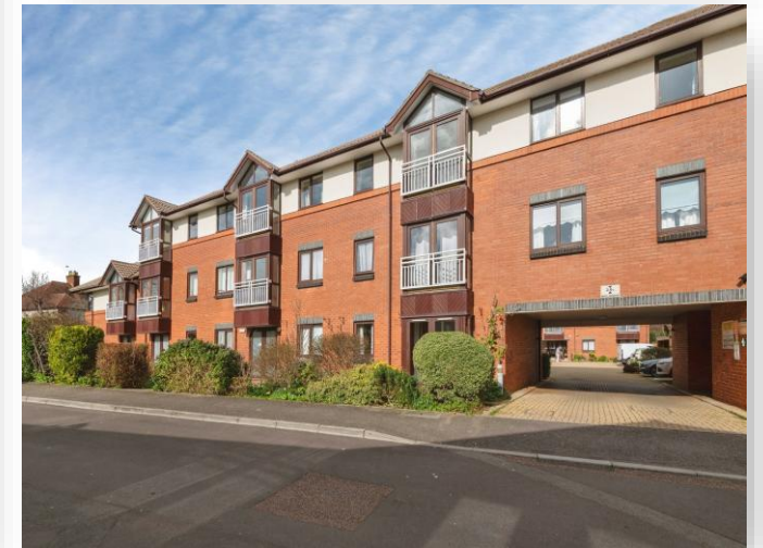
Peerage Court, Vennland Way, Minehead, TA24 5DA