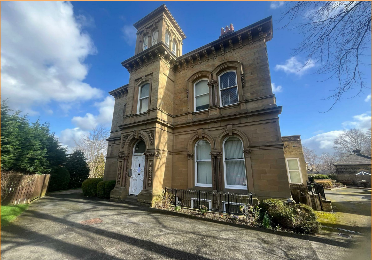
Edgerton Road Edgerton, Huddersfield, HD1 5RB