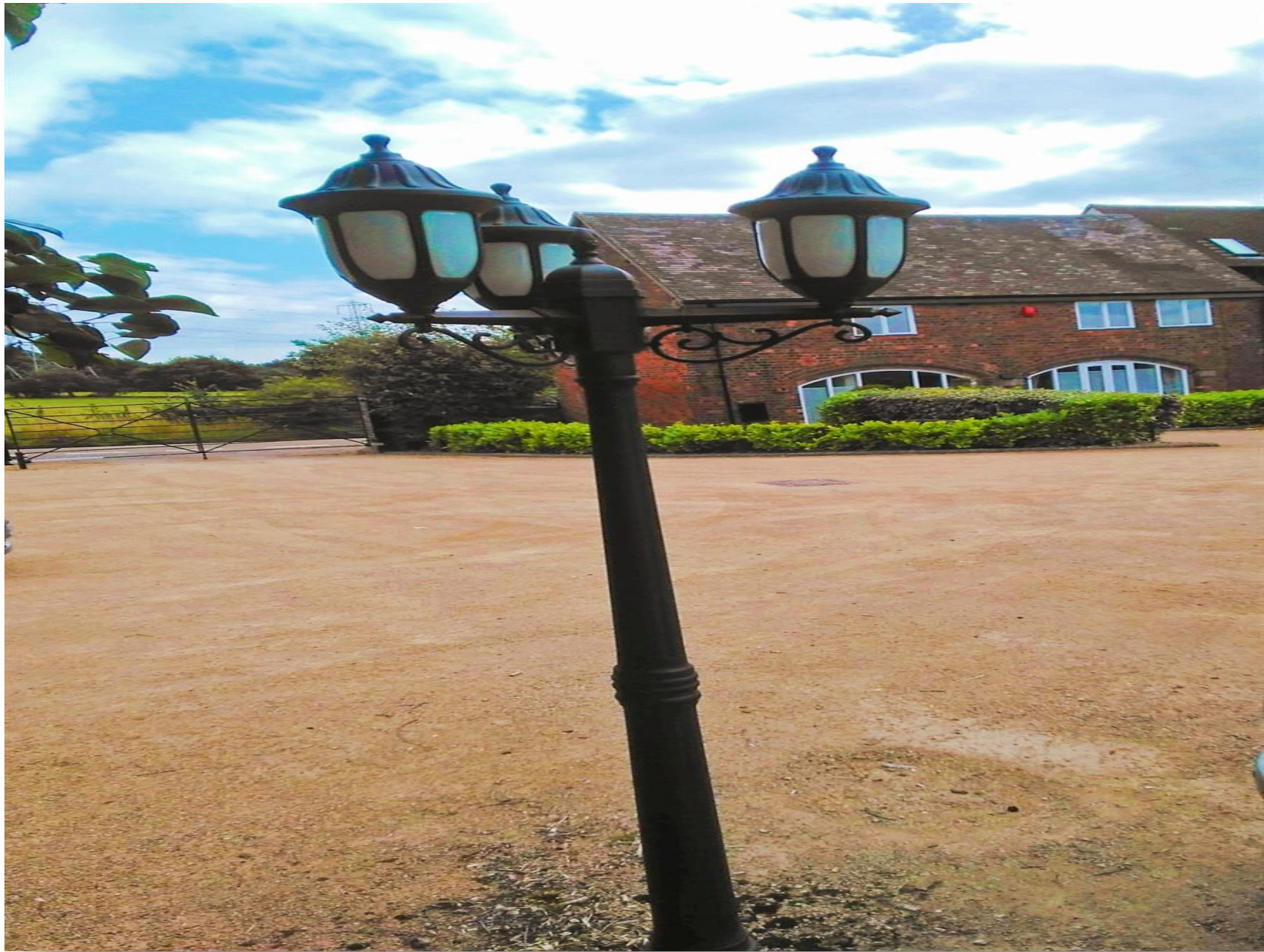
Old Hall Court Pinfold Lane, Aldridge Walsall WS9 0QU