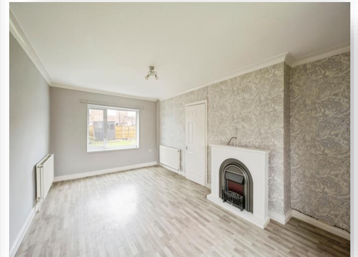
Parkgate Avenue, Conisbrough DONCASTER DN12 3NW