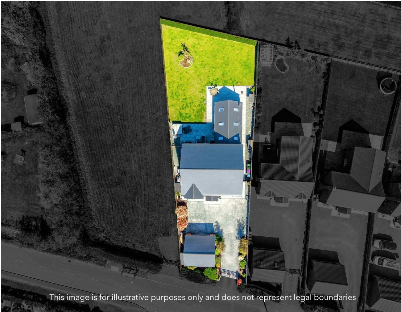
This image is for illustrative purposes only and does not represent legal boundaries