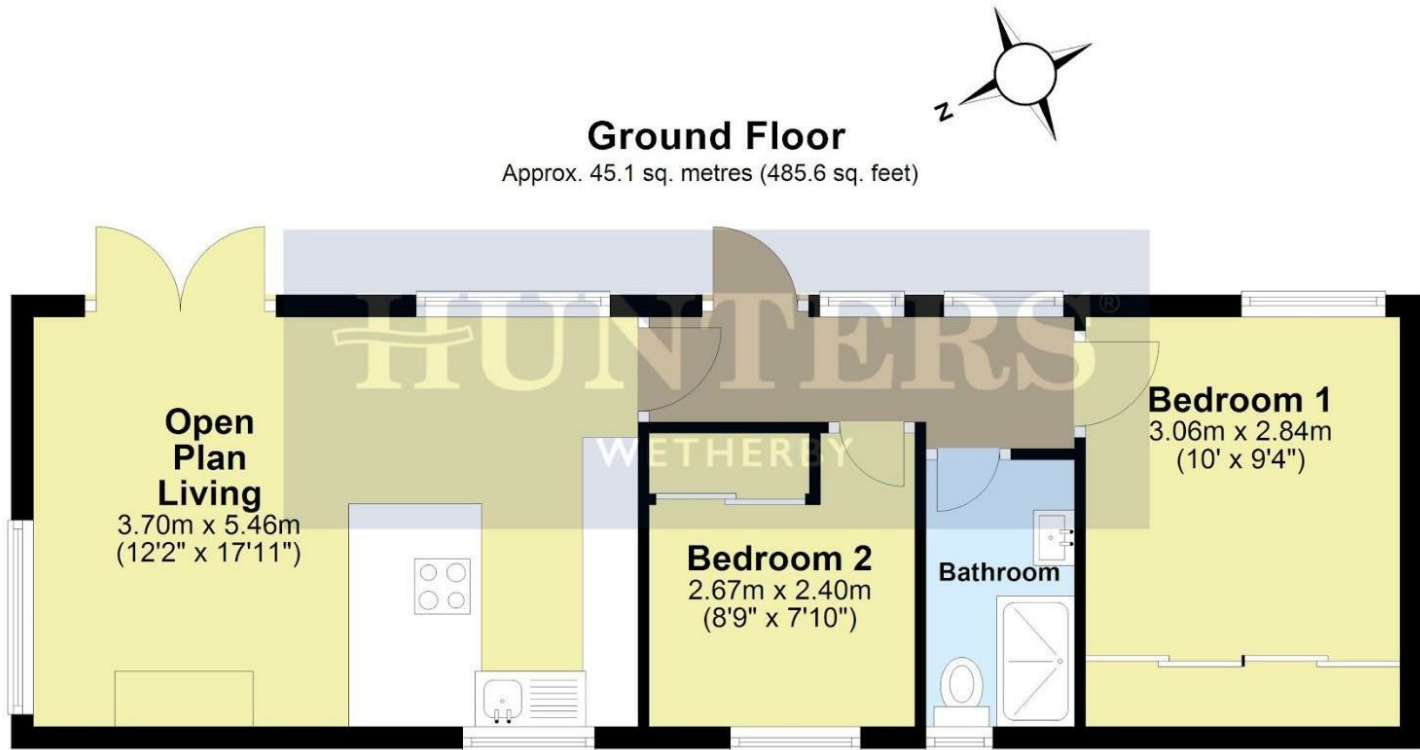
Ground Floor Approx. 45.1 sq. metres (485.6 sq. feet)

Total area: approx. 45.1 sq. metres (485.6 sq. feet)