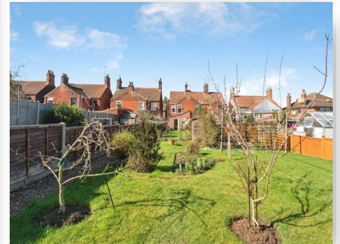
Queens Road, Fakenham NR21 8DB