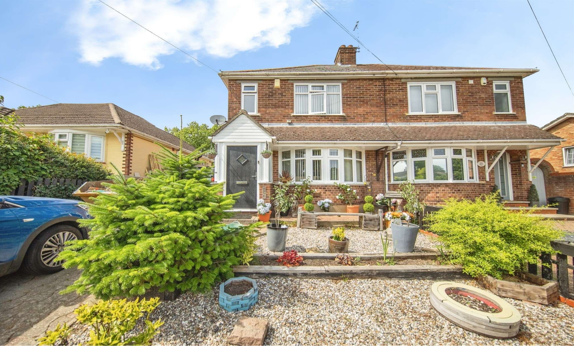
Harwich Road, Colchester, CO4 3DL