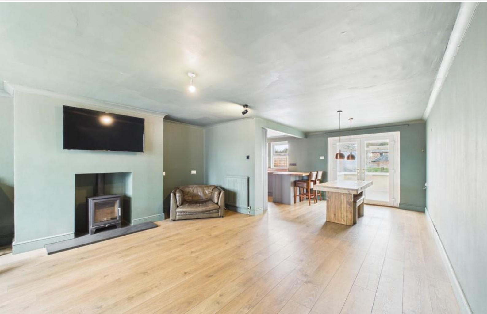
Living/ Dining Area