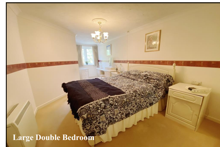
Large Double Bedroom