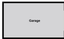
Ground Floor Area: 89.9 m 2 ... 968 ft 2