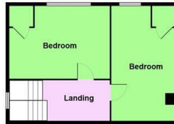
1st Floor Area: 41.3 m 2 ... 445 ft 2