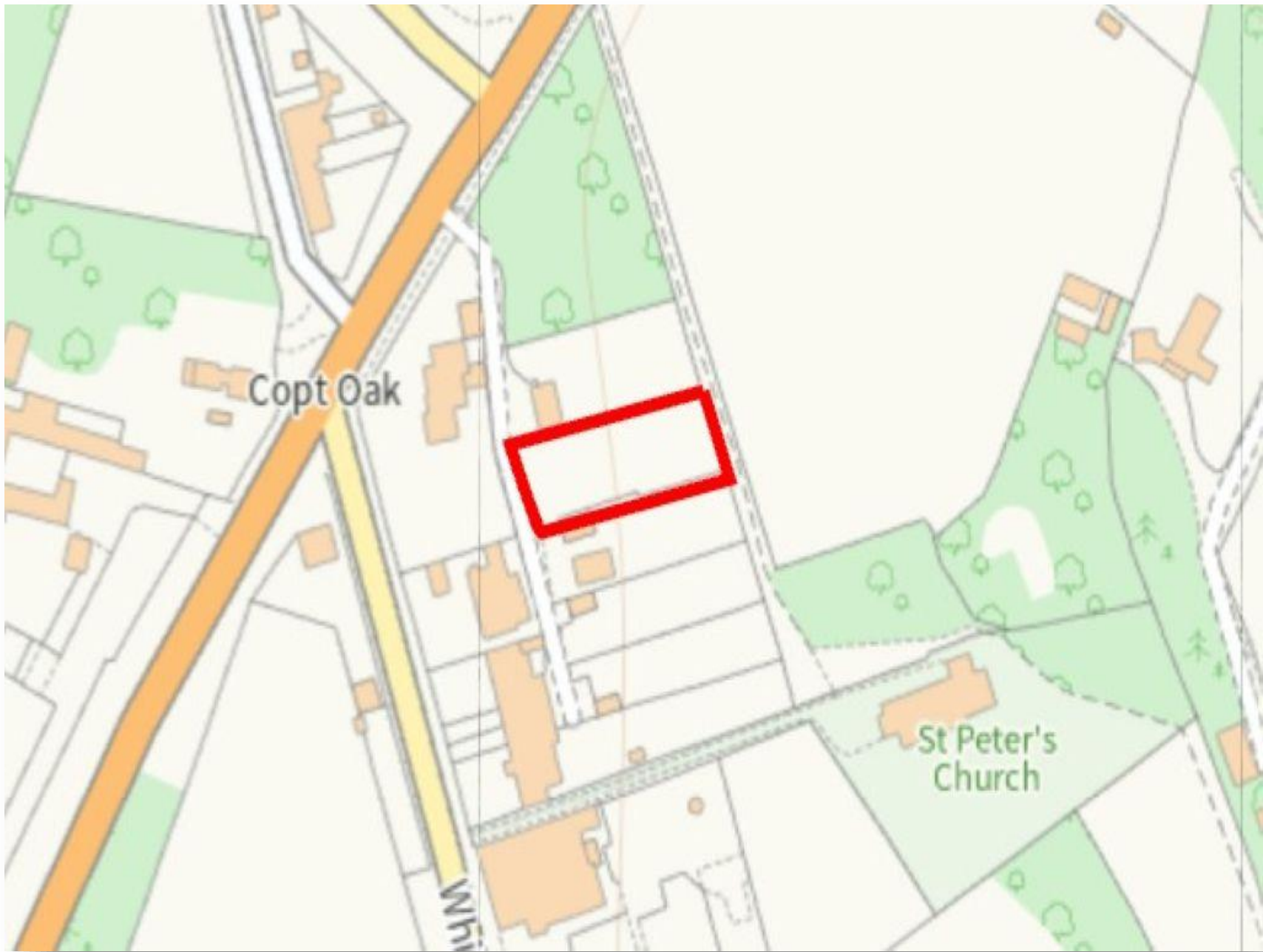
Land East Of Whitwick Road, Copt Oak, Markfield