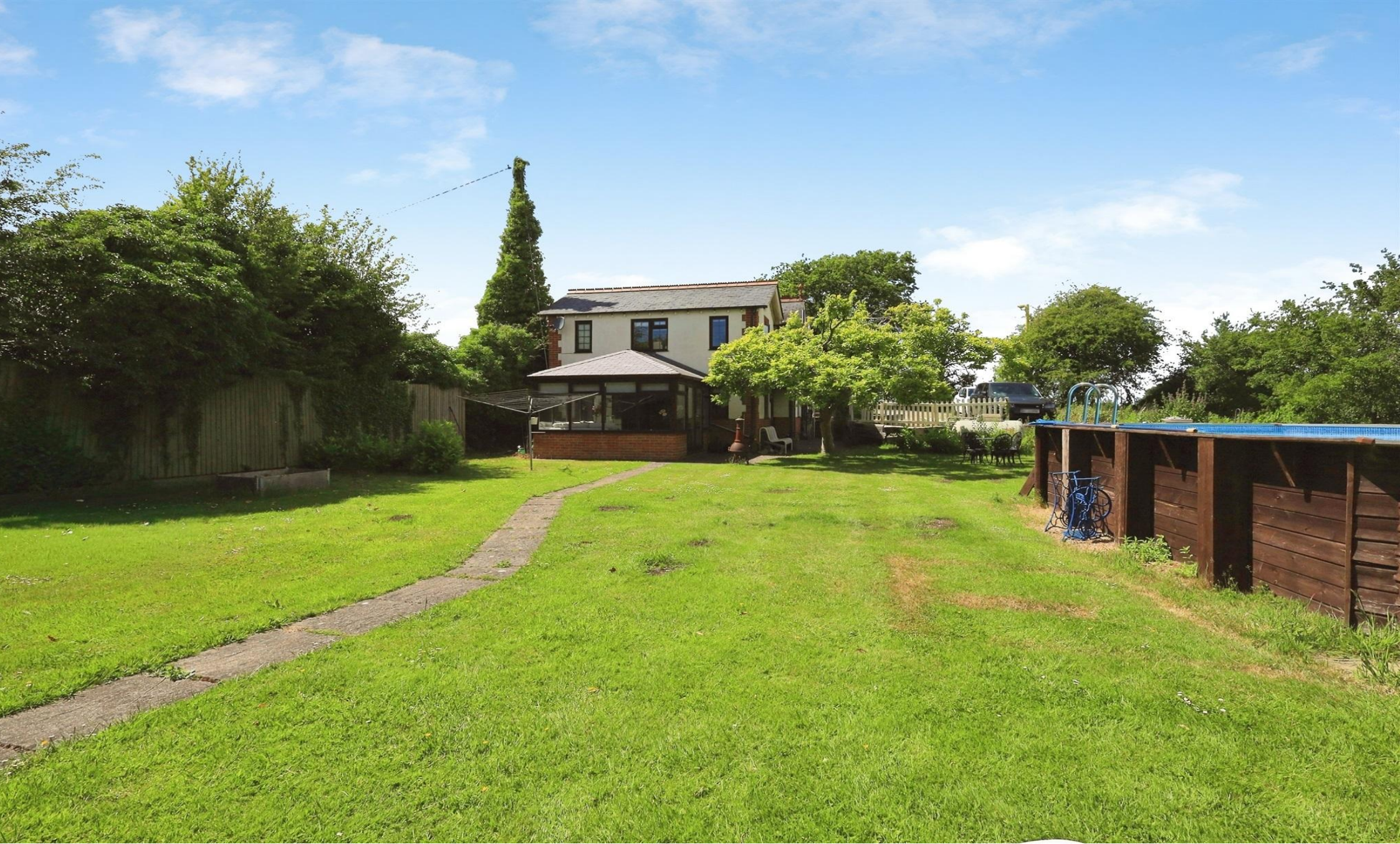
Gatehouse The Street, Selmeston Polegate BN26 6TX