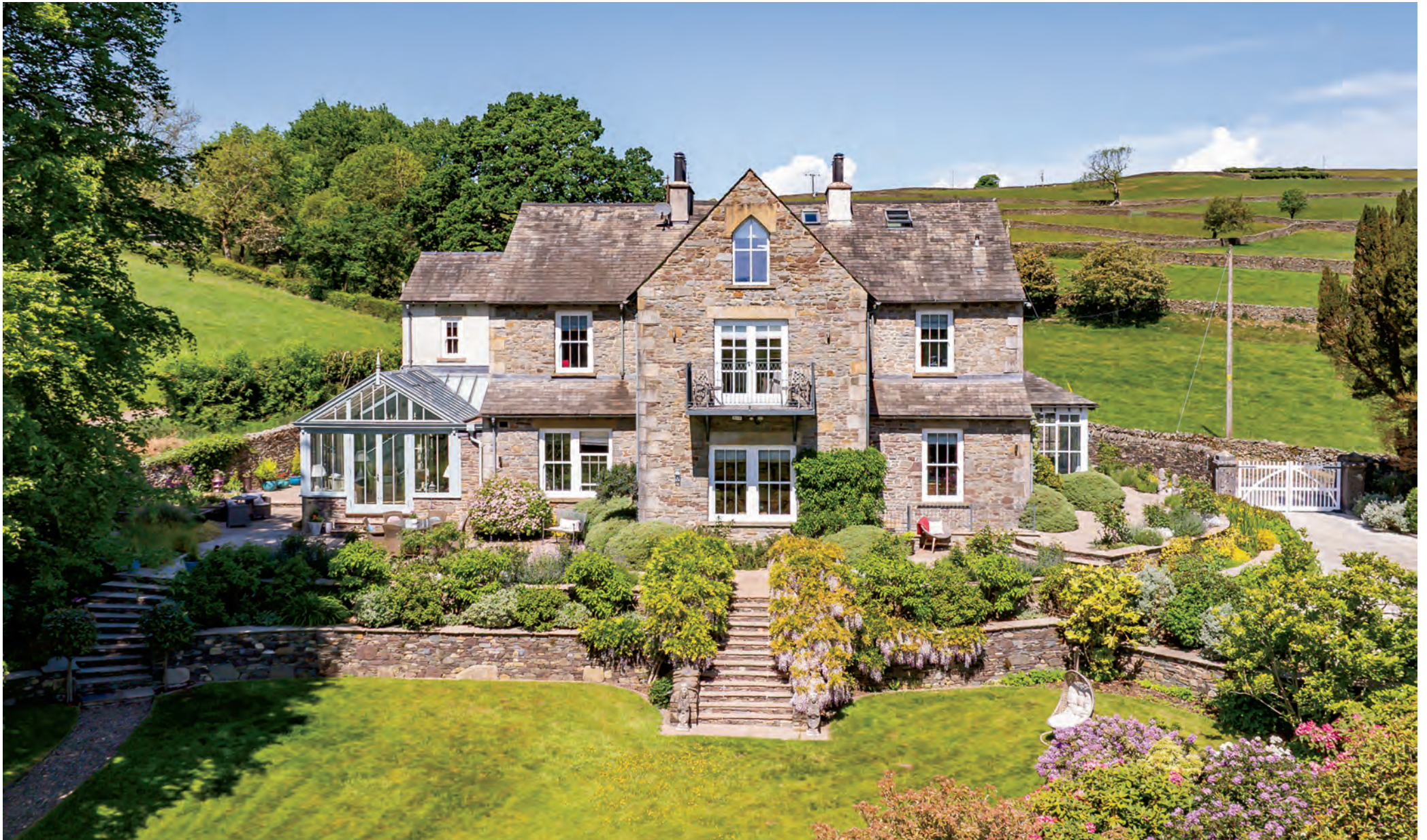
Friarsfield Mansergh | Kirkby Lonsdale | Cumbria | LA6 2EP