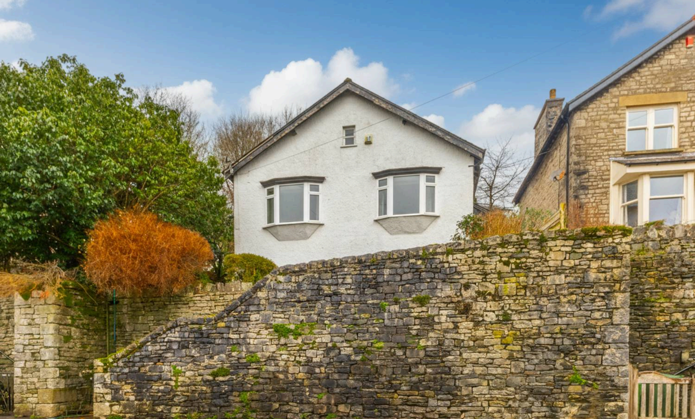
6 Horncop Lane, Kendal £350,000